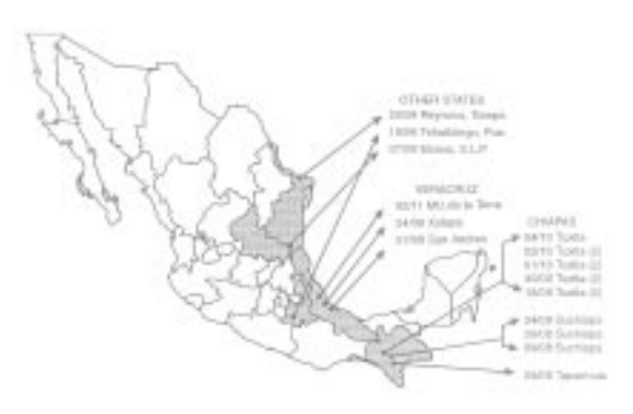
Figure 2. Geographic and temporal distribution of DEN-3 serotype in Mexico.