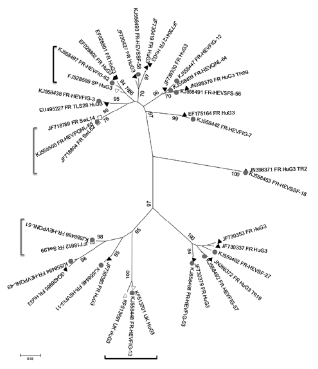
Figure. Phylogenetic tree of hepatitis E virus (HEV) sequences identified in food samples, France, 2011. Phylogenetic tree including 16 HEV sequences detected in food samples (gray circles) and the closest human (black triangles, French origin; white triangles, British or Spanish origin) or swine (white squares) sequences was constructed by using the neighbor-joining method with a bootstrap of 1,000 replicates based on the ClustalW alignment (MEGA4, http://www.megasoftware.net) on 290 nt sequences from open reading frame 2. HEV sequences retrieved from GenBank with >98% nt identity are indicated with their accession numbers. Bootstrap values of >70% are indicated on respective branches. Scale bar indicates nucleotide substitutions per site. Similar human and food sequences are shown in black brackets, similar swine and food sequences are shown in gray brackets.

Our findings clearly demonstrate that some food products that contain raw pork liver and are marketed to be