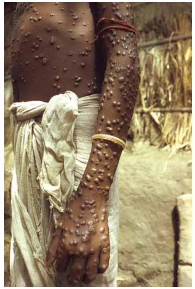
Figure 1. Patient with smallpox.

accidental or intentional release could cause illness in a population increasingly composed of unvaccinated persons. Anecdotal reports and formal scientific evidence have not ruled out the possibility that the virus may survive prolonged periods in preserved skin and tissue material, such as those that might be on display in museums, or in unearthed human remains. For example, permafrost is an environment that closely mirrors laboratory freezer storage of live virus, and the maintenance of viable smallpox virus in human remains found in such an environment has been debated (8). Environmental contamination with potentially live variola virus recovered from historical relics could threaten our confidence that the disease has been eradicated. In addition to immediate public health concern about such relics, there is much to be gained from investigation of artifacts in terms of scientific and historical interests.