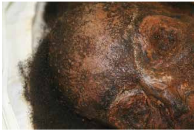
Figure 2. Mummified remains of a woman buried in an iron coffin, New York, New York, USA, mid-1800s.

for \leq 8 years before successful use (34). Thus, long-term storage and subsequent use of variola virus from preserved specimens have long been recognized. However, during the era of eradication, 45 scab specimens were collected from variolators and tested 9 months after collection; live virus was not isolated from any of the specimens (35). Nevertheless, stored crusts have caused immediate concern for potential exposures and their discovery has caused immediate exposure mitigation and testing.