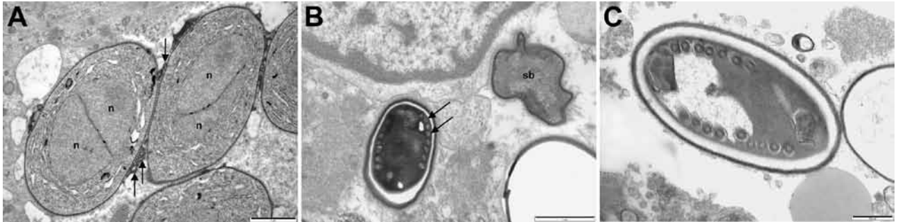
Figure 2. Electron micrographs of muscle biopsy tissue from a 66-year-old man (case-patient B) (A) and a 67-year-old man (case-patient A) (B,C) showing Anncaliia algerae . A) Early proliferative stage meronts with diplokaryotic nuclei (n) and vesiculotubular appendages (arrows) attached to the plasmalemma. Scale bar indicates 1 \mu m. B) Degenerate crenated sporoblast (sb) and a mature spore with visible coils of the polar tubule (arrows). Scale bar indicates 1 \mu m. C) Mature spore with 9 polar tubule coils in a single row, pale endospore, and a dense exospore. Scale bar indicates 500 nm.

differentiate Anncaliia spp. from Trachipleistophora hominis (3,5,23). Although electron microscopy is highly specific for microsporidiosis, the number of organisms within a biopsy specimen limits sensitivity. Features that define Anncaliia spp. include binary fission; diplokaryotic nuclei; lack of a parasitophorous vacuole, with the thickened plasmalemma of meronts and sporonts in direct contact with host cytoplasm; and vesiculotubular appendages projecting from the plasmalemma (Figure 2, panel A) (5,23). Degenerate sporoblasts and spores appear crenated (Figure 2, panel B). Mature spores have a dense exospore coat, a pale endospore, and single rows of 8–11 polar tubule coils (Figure 2, panels B, C). This number of polar tubule coils and the absence of deep protoplasmic extensions are features of A. algerae ; however, species identification also relies on nucleic acid sequence homology (5,23). DNA extracted from clinical specimens can be amplified by PCR (3,5). The primers target areas of the large and small subunit ribosomal RNA genes and sequence analysis enables identification of the organism.