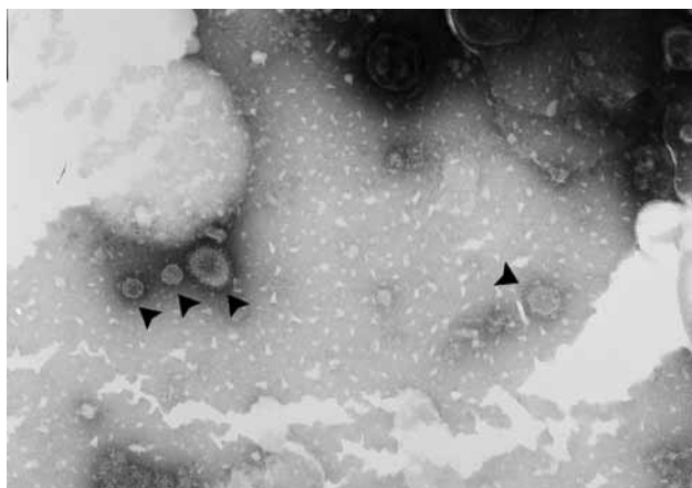
Figure 1. Negative-staining electron micrograph image showing influenza A(H1N1)pdm09 virus particles (arrowheads) in allantoic fluid supernatant collected from specific pathogen free eggs after injection with a nasal swab sample collected from a giant panda in China. Original magnification ×40,000.

To isolate and characterize the pH1N1 virus, we injected 10-day-old specific pathogen free embryonated chicken eggs with material collected from one of the nasal swab samples. Allantoic fluid from the injected eggs agglutinated 0.5% (vol/vol) chicken erythrocytes, indicating the presence of replication-competent virus in the nasal swab sample. When evaluated by electron microscopy, allantoic fluid supernatant from the infected egg displayed enveloped influenza virus-like particles of 100–120 nm (Figure 1).