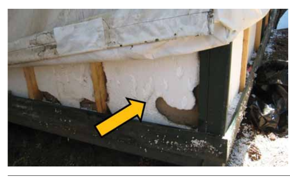
Figure 4. Damage from rodents tunneling in the foam insulation of a signature tent cabin, Yosemite National Park, summer 2012.

was active at Curry Village in summer 2012. This population, however, appeared to be substantially lower in September (trap success 14%), after the signature tent cabins were closed in late August and rodent control measures were implemented. The presence of SNV (14% seroprevalence) among these deer mice was comparable to the 16% seroprevalence reported previously in deer mice trapped at similar elevations in California ( 19 ).