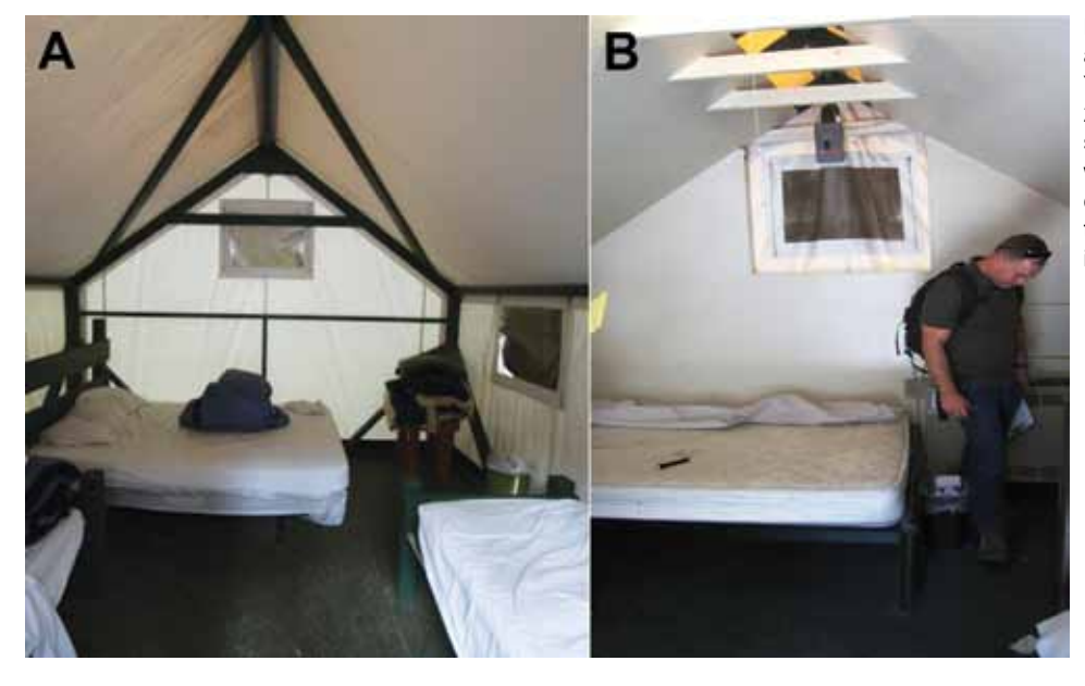
Figure 3. Inside view of regular and signature tent cabins, Yosemite National Park, summer 2012. A) Regular tent cabin showing canvas affixed over a wood frame. B) Signature tent cabin showing drywall between the exterior canvas and the interior living space.

educational materials were handed to every park visitor, and educational messages were posted in public areas, in lodgings, and on the park Internet site. Additional hantavirus awareness and prevention training sessions were provided to employees and volunteers within the park and NPS-wide. CDC developed an Internet page specific to the outbreak and added staff to its toll-free hantavirus hotline.