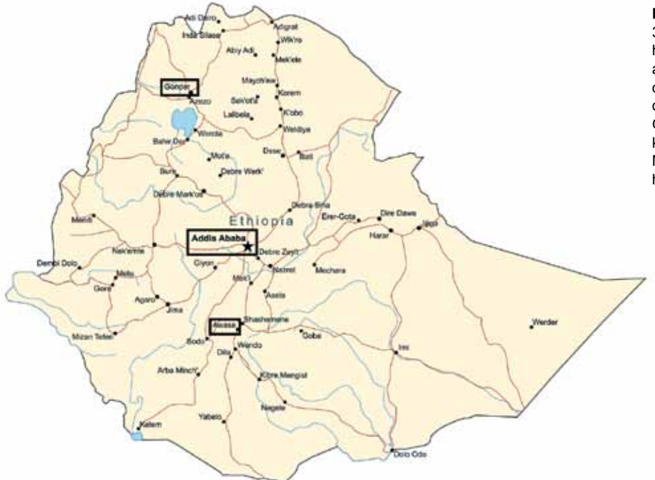
Figure 1. Locations (boxes) of the 3 meningitis surveillance study hospitals in Gondar, Addis Ababa, and Hawassa (also spelled Awasa or Awassa), Ethiopia. Air distances from Addis Ababa to Gondar and Hawassa are ≈420 km and 220 km, respectively.

Addis Ababa (14.4%). Culturing performed at AHRI identified a pathogen in 15 (10.8%) of the 139 patients: N. men ingitidis (n = 4), S. pneumoniae (n = 9), and H. influenzae (n = 1). Conventional multiplex PCR performed at AHRI identified DNA from the same 3 pathogens in 18 (12.9%) CSF samples: N. meningitidis (n = 7), S. pneumoniae (n = 10), and H. influenzae (n = 1). By multiplex real-time PCR of the same CSF samples, etiologic agent could be verified in 46 (33.1%) samples: N. meningitidis (n = 27; 19.4%), S. pneumoniae (n = 18; 12.9%), and H. influenzae (n = 1; 0.7%). For the remaining 93 patients, an etiologic agent for the meningitis episode was not determined.