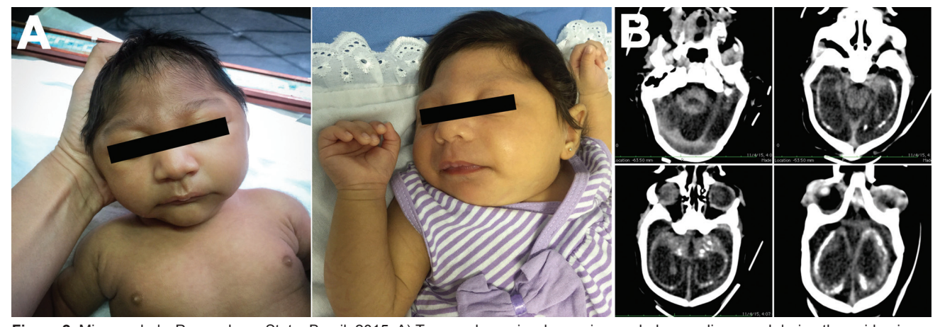
Figure 2. Microcephaly, Pernambuco State, Brazil, 2015. A) Two newborns in whom microcephaly was diagnosed during the epidemic. B) Brain computed tomography scan of a 43-day-old infant showing cerebellar hypoplasia, parenchymal calcifications, ventriculomegaly, and malformation of cortical development compatible with lissencephaly.

Pernambuco since December 2015, supported by the Brazilian Ministry of Health and the Pan American Health Organization, to establish an association between microcephaly and Zika virus (primary hypothesis) and explore other infectious or noninfectious causes.