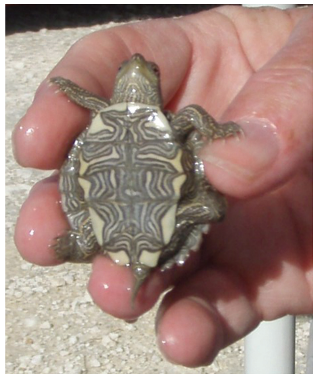
Figure. Small turtle with a shell length of <4 in (<10.16 cm).

The 8 multistate outbreaks reported in 2012 alone accounted for 473 reported illnesses; total estimated medical costs were \approx US $2,800,000 (17). Among 191 persons for whom information was available, 85 (45%) reported Hispanic ethnicity. Most reported turtles were small: 124 (88%) of 141 ill persons with turtle exposure reported that the implicated turtles had shell lengths of <4 in. Of 35 patients specifically asked their reason for purchasing a small turtle, all reported purchasing the turtle as a pet (17).