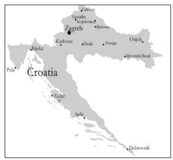
Figure 1. Croatian microbiology laboratories participating in surveillance of antimicrobial resistance.

Association, the committee organizes a 1-day meeting on antibiotic resistance in different counties. In addition, the committee organizes an annual course on laboratory methods that is mandatory and free of charge for the heads of the collaborating laboratories.