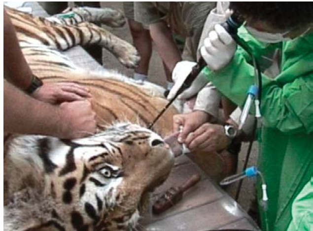
Figure 1. Obtaining a tracheal washing of the Siberian tiger by bronchoscopy.

Since the tiger had stopped eating and his condition had dramatically deteriorated, the animal was euthanized and