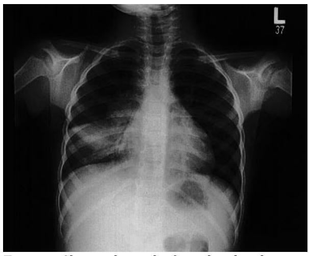
Figure 1. Chest radiograph of a girl with pulmonary tuberculosis. Note the significant hilar adenopathy in association with atelectasis, the so-called collapse-consolidation lesion.

The development of radiographic techniques, such as computed tomography (CT) scanning, illustrates some of the issues that arise when newer and more sensitive diagnostic tests become available (24). A CT scan may show enlarged or prominent mediastinal or hilar lymph nodes in some children with recent TB infection and a normal chest radiograph (25). In the absence of a CT scan, the child's disease stage would be called TB infection, and single drug therapy would be used. Many studies, involving thousands of children have shown this treatment to be successful. However, when the CT scan shows mild adenopathy, the clinician may consider this finding indicative of TB disease and treat with several drugs, although this probably is not necessary in the absence of drug resistance. These findings reinforce the idea that pediatric TB is a continuum, and the distinction between