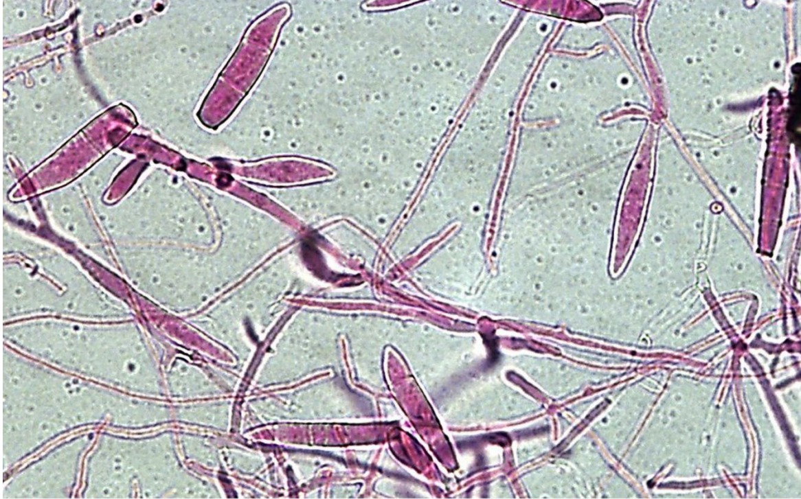
Appendix Figure 1. Microscopic feature of Trichophyton indotineae macroconidia, United Kingdom, 2017–2024. Sellotape preparation stained with lactofuchsin (original magnification, ×400).