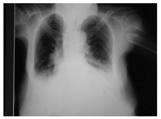
Figure 1. Chest radiograph at first admission.

Within the next two days, the patient progressively became breathless, with nausea and vomiting. There was no associated cough or diarrhea. She was eventually admitted to the medical department of Changi General Hospital, a designated non-SARS hospital, on March 25. On admission to the isolation room, she had a maximal tympanic temperature of 38.3°C, with defervescence the next day. She remained afebrile during the remainder of