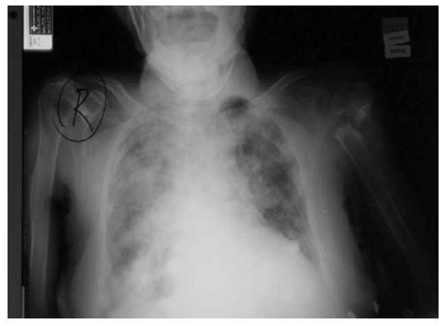
Figure 2. Repeat chest radiograph at second admission.

In the week after the patient's death, a cluster of cases of atypical pneumonia surfaced, all of which could be traced to this patient. Pneumonia developed in the patient's daughter-in-law, who had visited her in the hospital, and two grandsons living in the same household as the daugh-