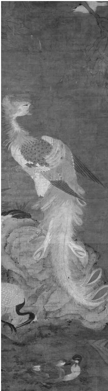
Phoenix and Birds (detail) China (c. 16th century) Ink and colors on silk (213.4 cm x 113 cm) Honolulu Academy of Arts, Hawaii, USA Gift of Charles M. and Anna C. Cooke Trust Fund, 1928 (141.1)