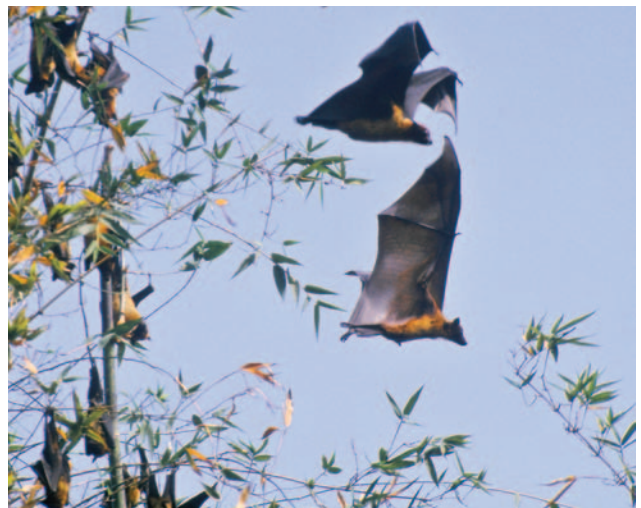
Figure 2. Giant Indian flying foxes ( Pteropus giganteus ).

Further surveillance for Asian bat lyssaviruses should be conducted. Public health authorities need to be aware of