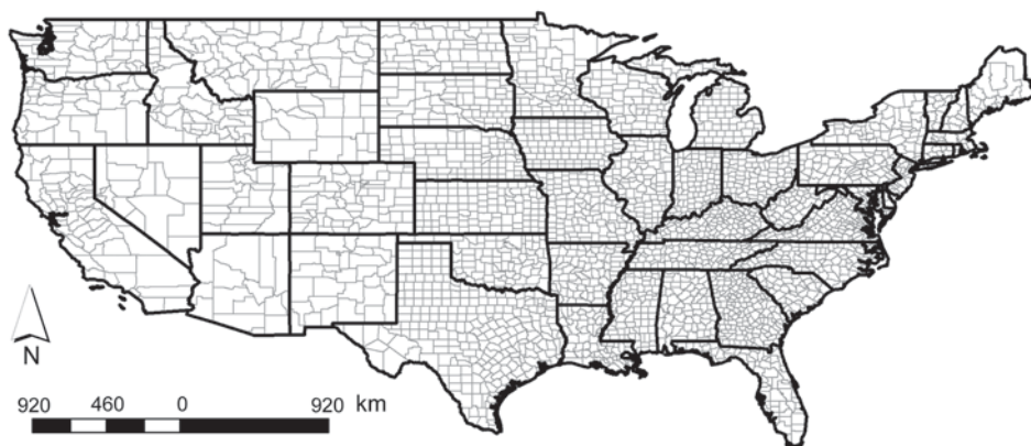
Figure 3. State and county boundaries within the contiguous United States. Note the increasing size of counties from east to west.

calculation and presentation of spatial patterns of different vectorborne diseases.