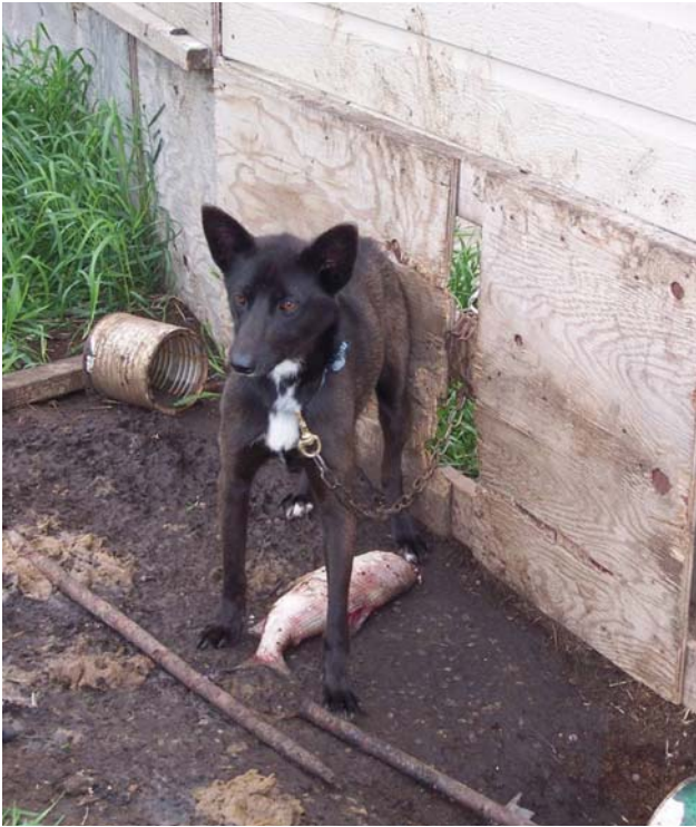
Figure 2. Northern dog with a typical meal.

spp., Cystoisospora spp., and Uncinaria spp. ( p < 0.0001 ). Dogs who ate wild game were more likely to have game-associated parasites such as Sarcocystis spp., Taenia spp., and Echinococcus spp. ( p < 0.05 ). No statistically significant associations were found between food or housing, and T. gondii or N. caninum infections and previous veterinary care or deworming had no effect on parasite prevalence.