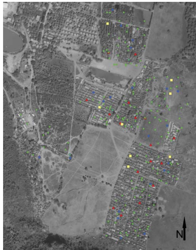
Figure 2. Locations of dwellings within camp for Hmong refugees with tuberculosis (TB), Thailand, February 2005. Symbols indicate dwellings of patients with the following types of TB: red triangles, multidrug-resistant; yellow squares, resistant to \geq 1 anti-TB medications but not MDR TB; blue circles, pansusceptible; green circles, unknown drug-susceptibility testing results.

After implementation of the final enhanced TB screening and treatment requirements, 97 additional TB cases, including 2 MDR TB, were diagnosed in Thailand, resulting in an overall total of 369 TB cases. As of April 2007, health departments in the United States reported 46 cases of TB, 6 of which were MDR TB, among 9,455 Hmong refugees who immigrated to the United States before implementation of enhanced screening (487 cases/100,000 persons). In