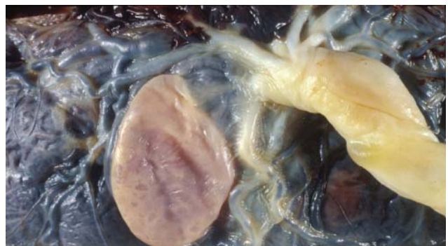
Figure 1. Fetal side of the placenta from Latin American pregnant woman who delivered her baby at Geneva University Hospitals, Geneva, Switzerland. A macroscopic subchorial liquid-filled cyst can be seen near the umbilical cord insertion.

In 2001, a 31-year-old woman from Santa Cruz, Bolivia, delivered a 2,860-g, full-term, apparently healthy baby at the Geneva University Hospitals after an uncomplicated pregnancy. Like most undocumented immigrants recently arrived in Switzerland, she had received no medical supervision during her pregnancy. She stated that a blood test for T. cruzi , conducted in Bolivia, had been negative. Macroscopic examination of the fetal side of the placenta showed a 3.5-cm, subchorial, liquid-filled cyst (Figure 1). Histopathologic examination showed disseminated chorioamnionitis and associated funiculitis with large numbers of nonflagellated parasites. A recent infection with Toxoplasma gondii was ruled out by serologic testing. Congenital T. cruzi infection was confirmed by a positive blood microscopic examination for the infant, a positive serologic test result for the mother (immunofluorescence assay using killed T. cruzi parasites, Swiss Tropical Institute, Basel, Switzerland), and a positive blood PCR with TCZ1/TCZ2 primers for both the mother and the newborn. Electrocardiogram and echocardiogram of the newborn showed no abnormalities. The newborn received nifurtimox (10 mg/kg/d for 60 days) without notable adverse effects. Parasitemia became undetectable at the end of treatment, and serologic test result at 1 year of age was negative. The mother refused to be treated, claiming that she was feeling fine.