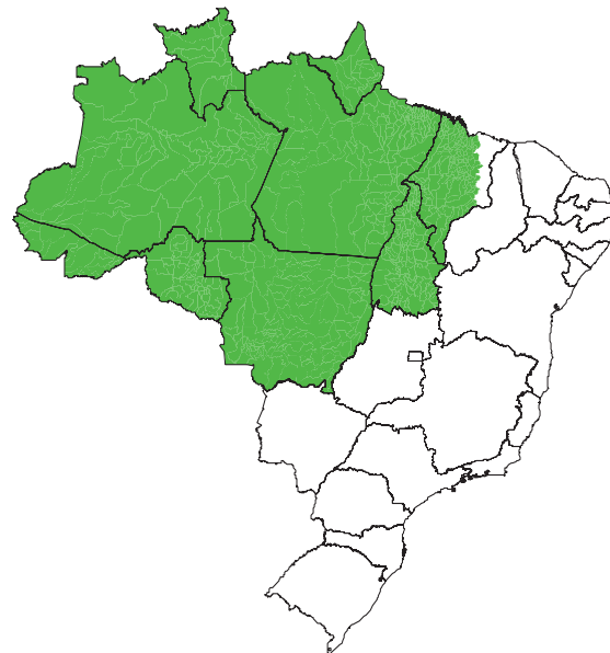
Figure 1. Map of Brazil showing the Amazon region (green).

For the resident population >10 years of age, a detailed analysis of the proportion of cases with missing data for education level (Figure 2) showed large reductions in leishmaniasis, leprosy, and tuberculosis over the period of eval-