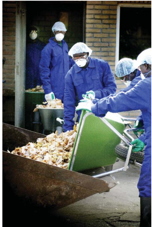
Figure 1. Poultry worker wearing respirator and safety glasses, the Netherlands, 2003.

The probability of becoming infected during a visit was calculated from the number of visits each person had made and whether each person was infected (according to the case definitions). The analysis comprised only visits to farms with infected poultry. During each visit, a person could either escape infection or become infected. The probability of each sequence of events could be added, from which the probability of infection per visit could be estimated by maximum likelihood (online Technical Appendix, www.cdc.gov/eid/ )