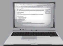
Table of contents Podcasts Ahead of Print Medscape CME Specialized topics