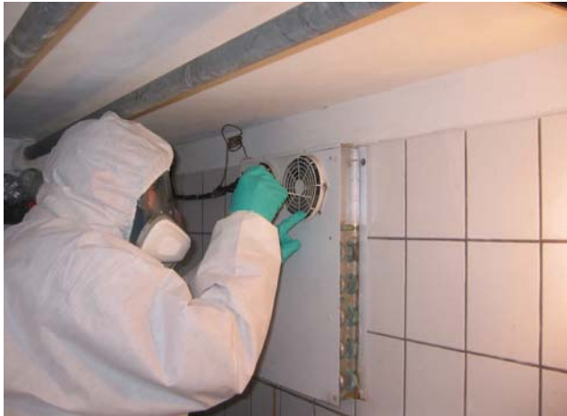
Figure 1. Sampling at the game chamber, Hesse, Germany, December 2005.

larenensis -specific DNA in hares showing a low signal in the screening PCR, we performed amplification of a 16S rRNA gene target followed by sequencing of the fragment.