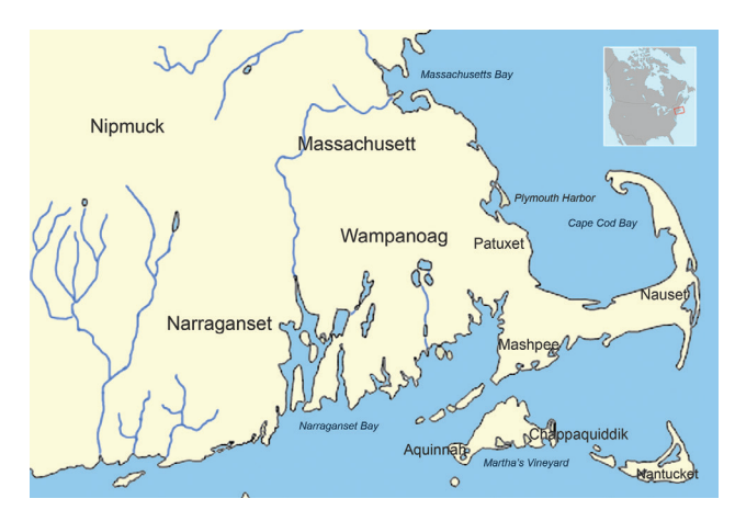
Figure 1. Native American tribes of southeastern Massachusetts in \approx 1620 .

Indigenous ecology was cataloged in 1604 when hundreds of coastal plants, trees, and animals (but not "vermine") were described (20). Before 1620, there were no peridomiciliary animals except for small dogs and mice (10), although other rodents (e.g., squirrels) were common. Precolonization and postcolonization English written