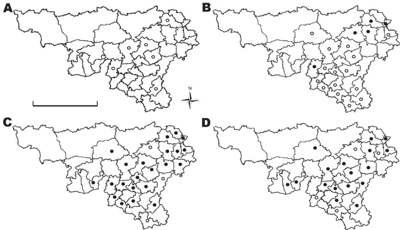
Figure 2. Distribution of red deer samples obtained in Belgium (Wallonia) in A) 2005, B) 2006, C) 2007, and D) 2008, and location of forest districts. White circles indicate districts where only seronegative animals were detected, and black circles indicate districts where seropositive animals were detected. Scale bar indicates 100 km.

home-range sizes and are seasonally territorial (7). Moreover, a recent follow-up of Culicoides spp. midge feeding patterns reported variations in host attractiveness, which could correlate with exhaled carbon dioxide and acetone (8), specific phenolic compounds emitted from urine (9) or hair fragrance (10).