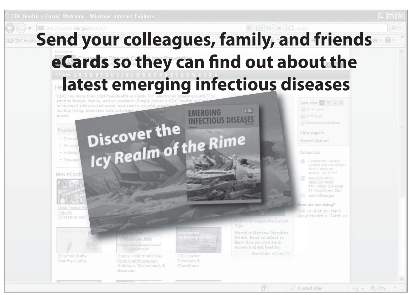
Emerging Infectious Diseases • www.cdc.gov/eid • Vol. 17, No. 10, October 2011