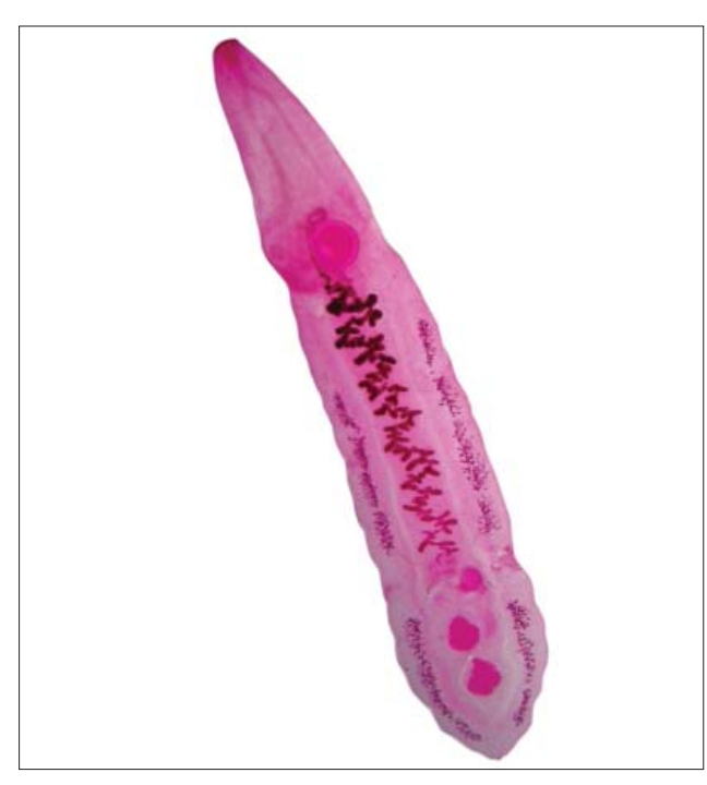
Figure 2 . Amphimerus spp. adult trematode (10.1 mm) recovered from a human, Ecuador.

In 1971, Yamaguti (1) suggested that a parasite previously reported in Ecuador (8) as O. guayaquilensis might in fact be Amphimerus spp. Subsequently, publications referred to this parasite as A. guayaquilensis (5,7); however, the accuracy of this reclassification is unclear. Molecular analysis could help clarify the ambiguities in genus/species identification of O. guayaquilensis parasites and the conspecific species of Amphimerus (15).