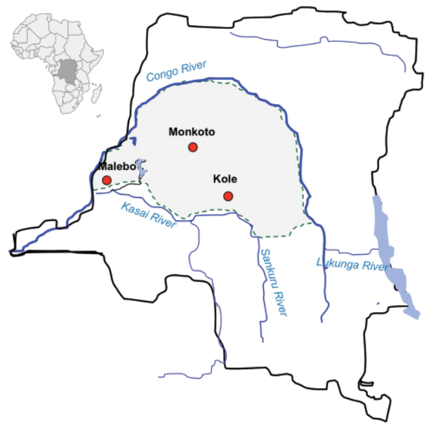
Figure 1. Sites in the Democratic Republic of the Congo where dried blood spots of nonhuman primates were collected (red circles).

peptide-coated beads. After washing, plates were incubated with 50 \mu L/well of 4 \mu g/mL biotinylated mouse antihuman IgG (BD Pharmingen, Le Pont de Claix, France) for 30 min at room temperature in the dark under continuous shaking. After washing, wells were incubated with 50 \mu L of 1 \mu g/mL streptavidin-R-phycoerythrin conjugate/well (Invitrogen/Molecular Probes, Cergy Pontoise, France) for 10 min in the dark while shaking. After 2 final washes with