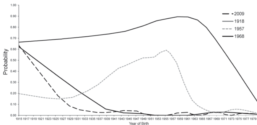
Figure. Seroprevalence of cross-reactive antibodies to the 1918, 1957, 1968, and 2009 pandemic influenza viruses among persons >23 years of age, New York, New York, 2004. LOESS (locally weighted scatterplot smoothing) curves represent the estimated prevalence of hemagglutination-inhibition antibody titers of \geq 40 (positive titers) by year of birth.

This study was supported, in part, by National Institutes of Health grants AI072258 and U54 AI057158 (the Northeast Biodefense Center-Lipkin grant) to C.F.B.