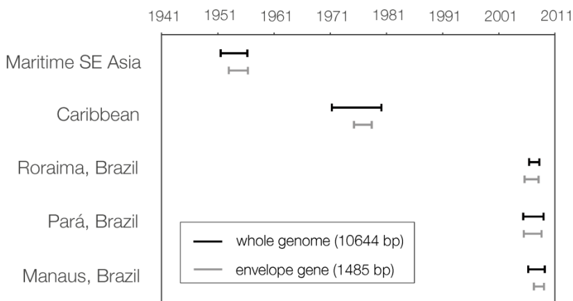
Technical Appendix Figure. Comparison of the divergence time of dengue virus 4 in Maritime Southeast Asia, the Caribbean, and Roraima, Pará, and Manaus States (Brazil) as estimated by using BEAST for full genome and envelope alignments.