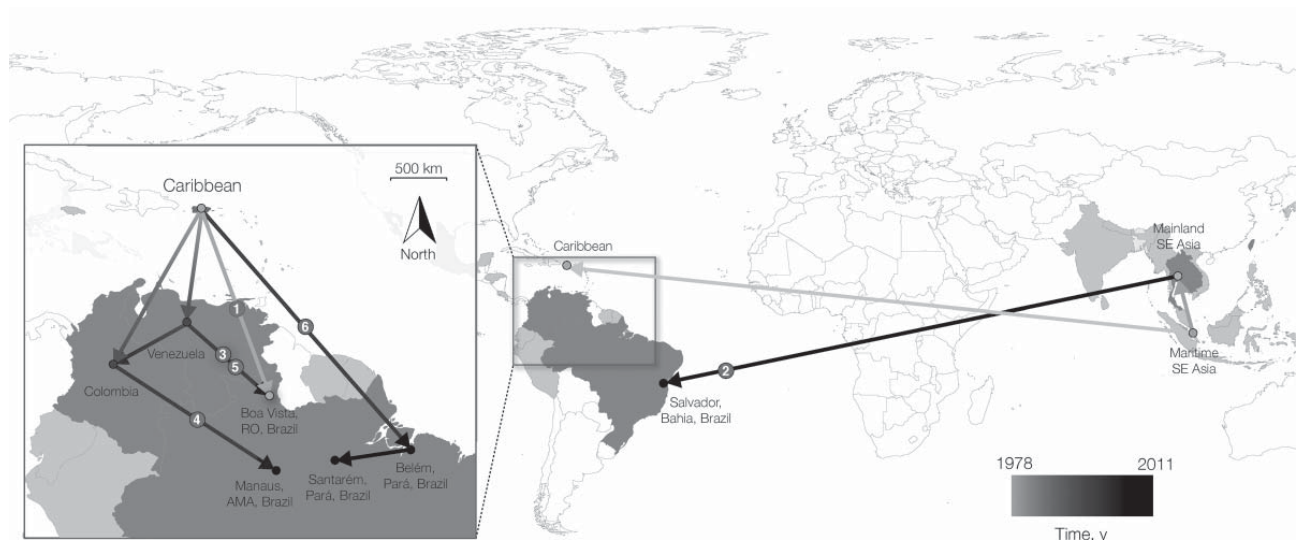
Figure 3. Overview of spatiotemporal dispersal of dengue virus type 4 (DENV-4) from Southeast (SE) Asia to the Caribbean region and then to South America. Links between geographic locations represent phylogeny branches of the full genome maximum clade credibility tree, as projected by using SPREAD software (20). The time gradient is coded to the arrows and depicts the relative time elapsed since the earliest inferred viral migration out of Southeast Asia (i.e., 1978, 95% Bayesian credible interval 1977–1980). Introductions are numbered as in Figure 1. Medium gray indicates the presence of DENV-4 where genomic data were available; dark gray indicates sampled countries where complete genomic sequence data were available; white indicates no genomic data available; and circles indicate sampled locations and are colored according to the earliest migration that was detected from the sink location. RO, Roraima State; AMA, Amazonas State. A color version of this figure is available online ( wwwnc.cdc.gov/EID/article/18/11/12-0217-F2.htm ).

nearly 3 decades of no circulation highlights the potential for future outbreaks of genotype I in this country. The presence of a serotype against which the population is not immunized indicates that the country is at risk for a sharp increase in the number of dengue virus infections, including severe cases (8).