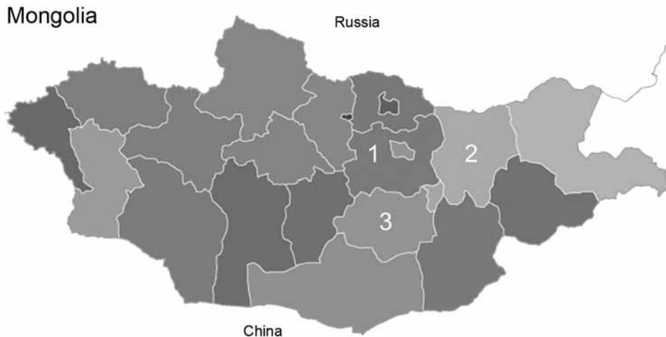
Figure 1. The 3 aimags from which nasal swab specimens were collected from healthy Bactrian camels, for influenza A virus testing, Mongolia, 2012. 1, Töv; 2, Khentii; 3, Dundgovi.

Only 1 specimen was confirmed positive by influenza A-specific qRT-PCR (cycle threshold [ C_t ] <35 ), suggesting possible virus degradation during shipment, despite specimens being shipped on dry ice and carefully handled upon receipt (10). The original swab specimen from a camel was later shared with the Mongolia National Influenza Center for confirmation in an anonymized panel of 10 camel swab specimens. Using WHO qRT-PCR procedures, staff identified the specimen as having the strongest evidence (by C_t ) of influenza A virus. Staff further studied the specimen with conventional RT-PCR primers and probes for the hemagglutinin and neuraminidase genes. These reactions yielded amplicons of the expected size, which were sequenced and found to be 100% identical to the corresponding portions of the J. Craig Venter Institute (Rockville, MD, USA) sequences described below.