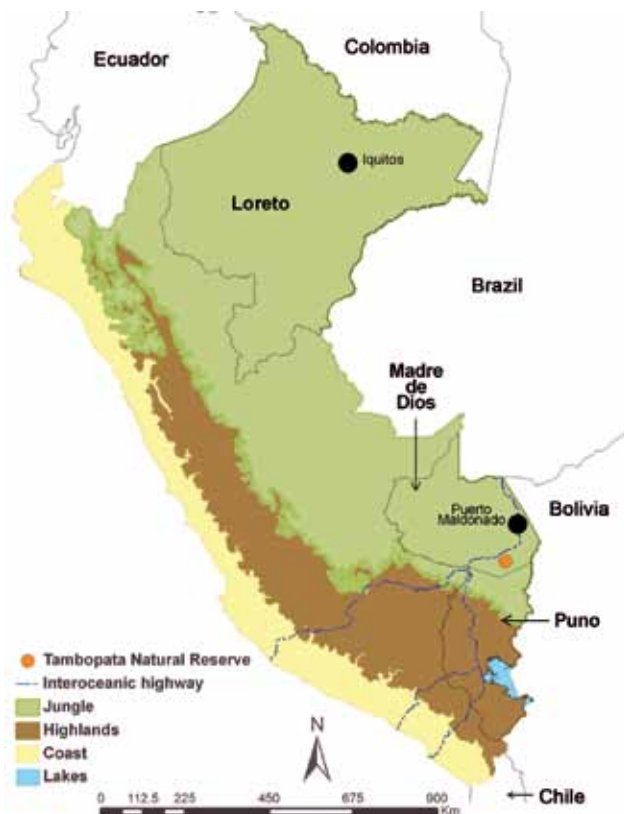
Figure 1. Regions of Peru, indicating areas of previous hantavirus study (Loreto [2]) and the study of hantaviruses described in this article (Madre de Dios and Puno). Capital cities of the Loreto and Madre de Dios Regions are indicated by black dots.

rodents. PCR targeted a 434-bp region of the hantavirus small (S) segment and 296- and 242-bp regions of the medium (M) segment G1 and G2 regions, respectively (8). Ion Torrent Personal Genome Machine (Life Technologies, Carlsbad, CA, USA) high-throughput sequencing and additional consensus RT-PCR on ELISA-positive rodents were performed at Columbia University in New York, NY, USA. Rodent species was determined on the basis of morphometric assessment by experienced mammalogists at the San Marcos University Natural History Museum in Lima, Peru; identification of IgG-positive animals was confirmed by DNA extraction from the liver followed by PCR amplification and sequencing of the cytochrome b gene (9).