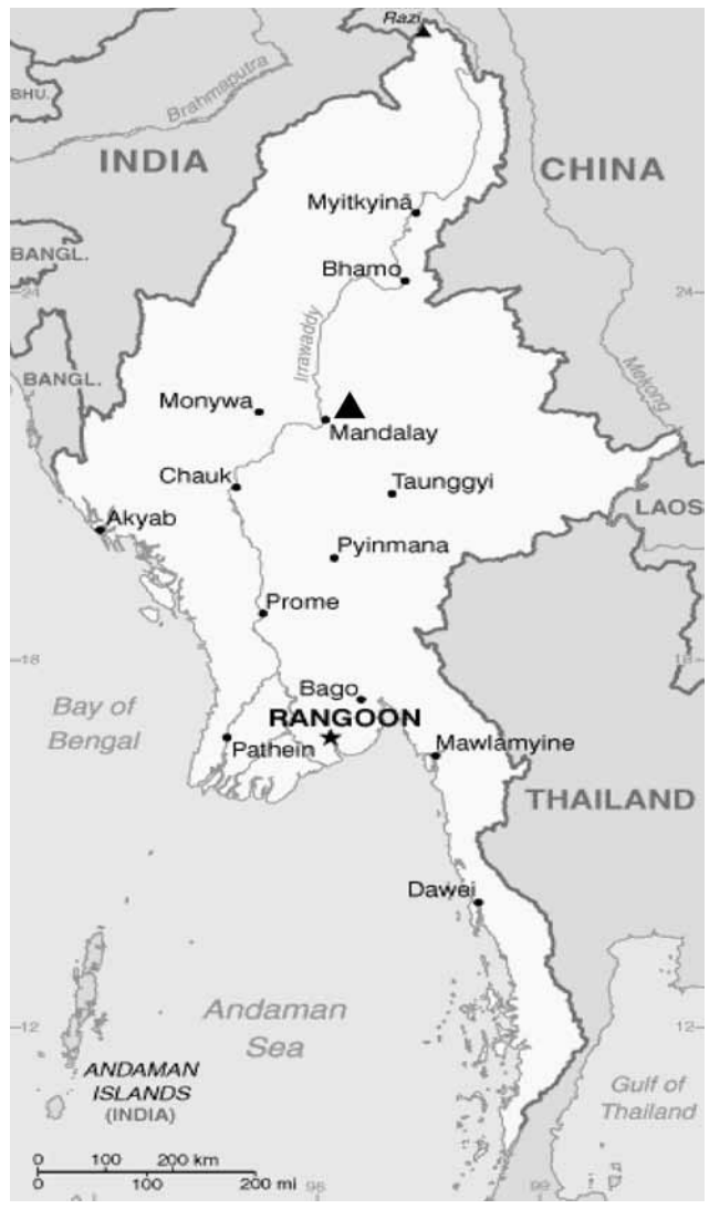
Figure 1. Location of Mandalay Children Hospital (triangle) in Myanmar.

During July–October 2010, serum samples were collected from 116 children ( \leq 12 years of age) who were