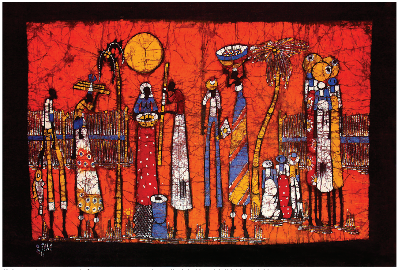
Unknown (contemporary). Cotton canvas, pastel, acrylic, ink. 39 × 59 in/99.06 × 149.86 cm. Parque dos Continuadores, Maputo, Mozambique. Personal Collection, Philip Lederer, USA.