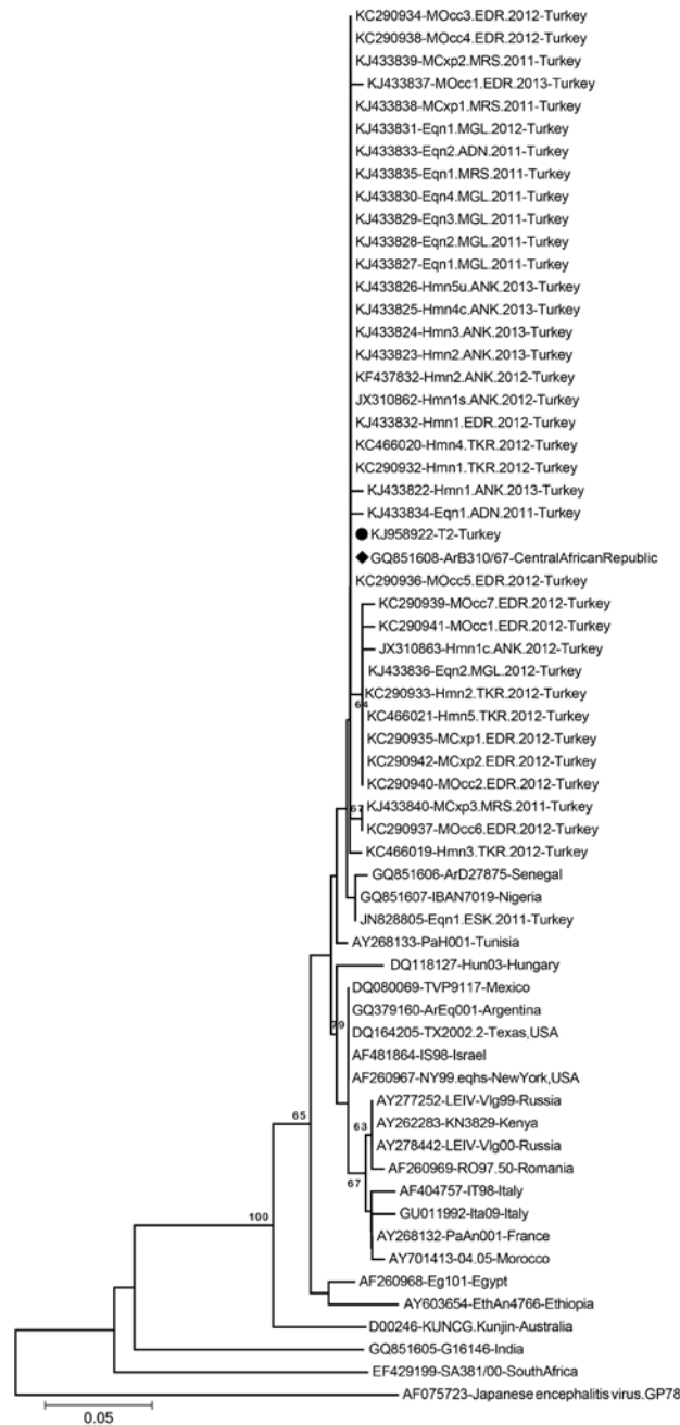
Figure 2. Neighbor-joining phylogenetic tree constructed on the basis of the West Nile virus (WNV) partial envelope gene nucleotide sequences (183 nt) of 38 WNV strains from Turkey and selected global strains. Black dot indicates WNV isolate T2 from Turkey, and black diamond indicates the closely related strain ArB310/67 from the Central African Republic. Bootstrap values of major branches are given for 1,000 replicates. GenBank accession number, name, and country of isolation are given for global strains. Local sequences are indicated by GenBank accession number, host, location, and year. ADN, Adana Province; ANK, Ankara Province; Cxp, Culex pipiens ; EDR, Edirne Province; Eqn, equine; ESK, Eskisehir Province; Hmn, human; M, mosquito; MGL, Mugla Province; MRS, Mersin Province; Occ, Ochleratatus caspius ; TKR, Tekirdag Province. Scale bar indicates substitutions per site.

were absent from this strain. However, the NS1-A70S substitution noted in cluster 2 viruses was observed as A70V in strain T2. Furthermore, NS3-P249T and NS5-V258A substitutions, reported in several strains of the Mediterranean subtype (12), were detected in the T2 strain. These findings suggest that the T2 strain evolved independently from other Mediterranean strains from a common ancestor of African origin.