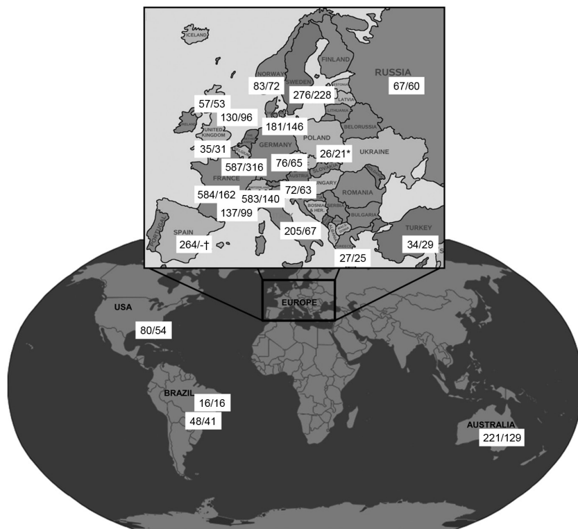
Figure 1. Study characteristics (number of isolates/patients screened) from 22 centers in 19 countries participating in a study of azole resistance in Aspergillus fumigatus . *Period screened was 8 months instead of 1 year in this center for unknown reason. †Total number of screened patients is unknown because this center is a reference laboratory that does not have access to patient characteristics.

on Antimicrobial Susceptibility Testing) broth microdilution reference method (6), and determination of the full coding sequence of both strands of the cyp51A gene and the promoter region by PCR amplification. For every resistant isolate, a susceptible control isolate was assigned; this control isolate was the first susceptible isolate screened on the 4-well plate format in the same center after the resistant isolate, and they received molecular species identification and susceptibility testing according to the EUCAST broth microdilution reference method (6).