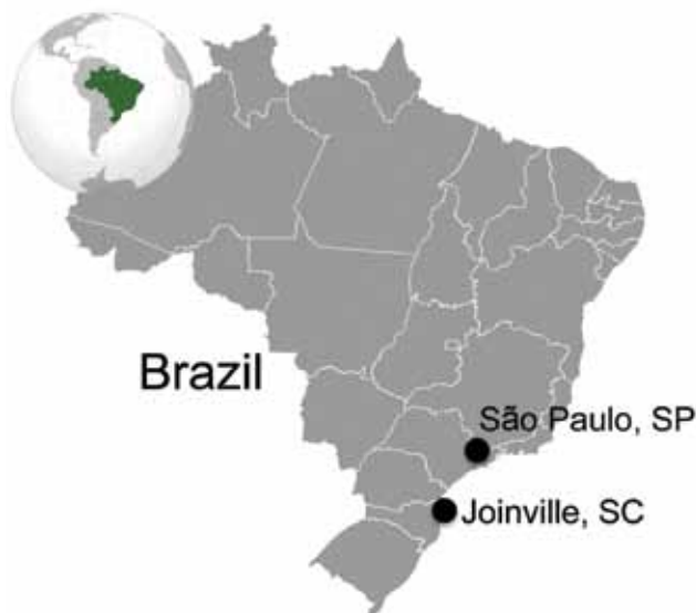
Figure 2. Cities where retinochoroidal scars consistent with Toxoplasma gondii infection were found on eyes donated to eye banks in Brazil during 1985 and 2009: São Paulo, São Paulo (SP) State, and its relative position in southern Brazil to Joinville, Santa Catarina (SC) State; 522 km separates the 2 cities.

type I alleles, 1 had a unique allele sharing phylogenetic ancestry with type I, 2 had drifted type II or type III alleles, and 4 possessed a mixture of 2 allelic types, indicative of mixed strain co-infection. The detection of 5, 3, and 3 distinct and mostly novel alleles at NTS2, B1, and GRA7, respectively, argue against the possibility that the PCR results were due to a false-negative amplification. A high incidence of mixed infection has been observed previously in Australian marsupials (8), but it is considered rare in human infection (9). In contrast, only 6 samples were positive at B1 (sensitivity 46% relative to NTS2); 1 sample had a type I allele, 4 had a unique allele, and 1 (no. 5) had a mixture of 2 different alleles. Three samples were positive at GRA7 (sensitivity 23% relative to NTS2); a type I allele, and 2 alleles sharing phylogenetic ancestry with type I and type III, respectively (online Technical Appendix Table).