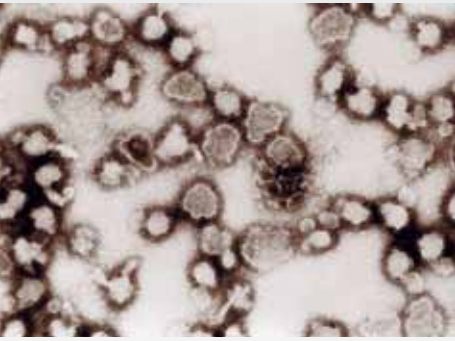
This electron micrograph reveals the morphologic traits of the La Cross virus (LCV), a Bunyaviridae virus family member.

In 1995, the Bunyaviridae Study Group of the International Committee on Taxonomy of Viruses recommended adding the prefix "ortho-" (Greek for "correct") to the genus name (C. Calisher, pers. comm.) to prevent confusion. Two orthobunyaviruses reported on in this issue of Emerging Infectious Diseases are Inkoo virus and Chatanga virus (named for the towns of Inkoo, Finland, and Khatanga, Russia, respectively, where they were first isolated).