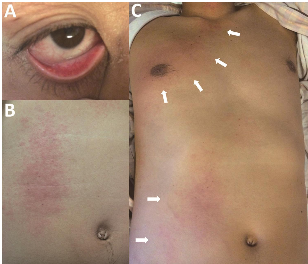
Technical Appendix Figure 1. Congested bulbar conjunctivae and skin rash on the patient's trunk at initial hospital visit of patient with Leptospira licerasiae infection. A) Congested bulbar conjunctivae resolved shortly after the initiation of antibiotics. (B, C) Localized skin rash (arrows) on the patient's trunk was treated with antihistamine cream. The relationship between Leptospira infection and skin rash was unclear in this case.