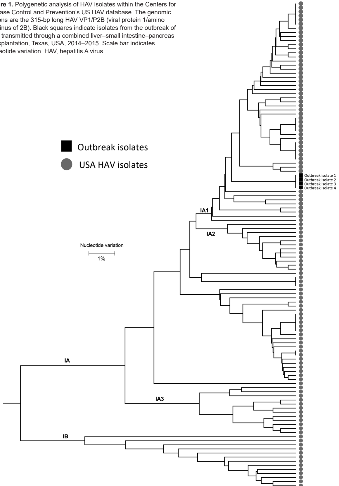
Figure 1. Polygenetic analysis of HAV isolates within the Centers for Disease Control and Prevention’s US HAV database. The genomic regions are the 315-bp long HAV VP1/P2B (viral protein 1/amino terminus of 2B). Black squares indicate isolates from the outbreak of HAV transmitted through a combined liver–small intestine–pancreas transplantation, Texas, USA, 2014–2015. Scale bar indicates nucleotide variation. HAV, hepatitis A virus.