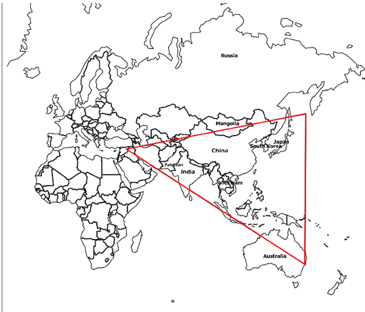
Technical Appendix Figure 1. The tsutsugamushi triangle (in red). More than 1,000,000 cases of scrub typhus, which is a mite-borne infection caused by the bacterium, Orientia tsutsugamushi , were reported in this area during 2003.