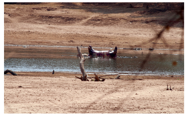
Figure 4. A dead hippopotamus floating down the South Luangwa River in northeastern Zambia during an anthrax outbreak in 2011.

The second part of the investigation involved going into the field to view 3 of the areas where most of the infected hippopotamuses were found. The site visits occurred within about a month after the outbreak and were conducted to better understand the topography and the range of the animals and to identify any additional animal species affected by anthrax. All sites were areas frequented by the exposed human populations and were <1 km from residents' homes. The site surveys were not exhaustive; they focused on areas with known human-animal interaction (Figure 3) and recently discovered dead hippopotamuses (Figure 4). N95 masks, Tyvek suits, and rubber boots were worn