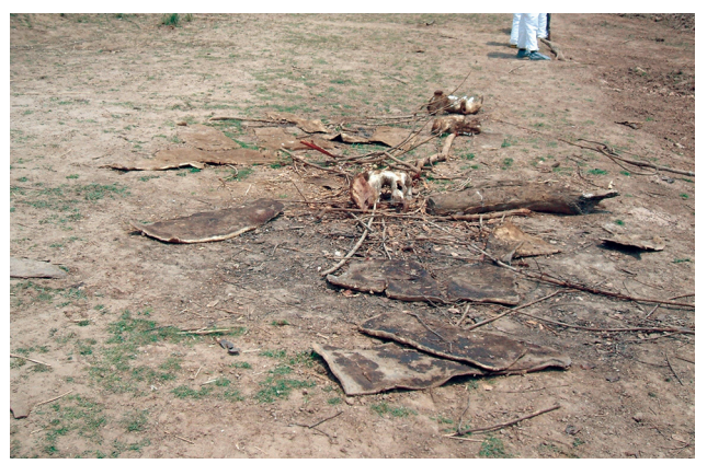
Figure 3. Hippopotamus bones and hides left behind after butchering of animals that were found dead on a river bank and later identified as the source of anthrax causing an outbreak among humans in northeastern Zambia, 2011.

Three teams administered the questionnaire, each team made up of a trained District Health Office staff supervisor and 6 trained volunteer interviewers. Each team was assigned to 1 of the 3 communities. Interviewers selected every fifth household they encountered in each village for inclusion and interviewed all adults \geq 15 years of age living in selected households. No incentives were offered for participation. Interviewers read each prospective participant a description of the survey, highlighting that it was voluntary and could be stopped at any time by request. The Zambia Ministry of Health deemed this outbreak investigation to be exempt from Research Ethics Committee review. The investigation protocol was reviewed by the CDC-Zambia office and CDC's National Center for Emerging and Zoonotic Infectious Diseases, in accordance with institutional review policies. The protocol was determined to be nonresearch under 45 CFR 46 §102(d) and therefore did not require Institutional Review Board review.