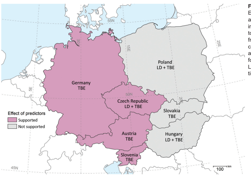
Figure 1. Countries in central Europe where Lyme disease and tickborne encephalitis incidence were analyzed relative to the common vole abundance from the Czech Republic and climate indices, 2000–2017, and where we found evidence for these external predictors. LD, Lyme disease; TBE, tickborne encephalitis.

vole density with a lag of 1 year for the Czech Republic, Germany, and Slovenia (Appendix Figure 7). A lag of 1 year for the effect of the annual NAO index was negatively correlated with TBE incidence in the Czech Republic and Germany, whereas a 2-year lag was positively correlated with TBE incidence in Germany and Austria (Appendix Figure 8). Autoregressive linear models showed that including vole abundance from year t - 1 improved fit for the Czech Republic, Germany, and Slovenia (Table 2). Adding the effect of the annual NAO index in t - 1 to the model improved the fit in the Czech Republic and Germany. The effect of the annual NAO index in t - 2 produced better predictive power for Austria. As a result, the best models for TBE incidence in all 4 countries (Czech Republic, Germany, Slovenia, and Austria) included both host abundance and climate effect. Incidence of both diseases fluctuated over time in close synchrony, as revealed for the Czech Republic (correlation coefficient 0.71) and Poland (correlation coefficient 0.70) (Appendix Figure 9).