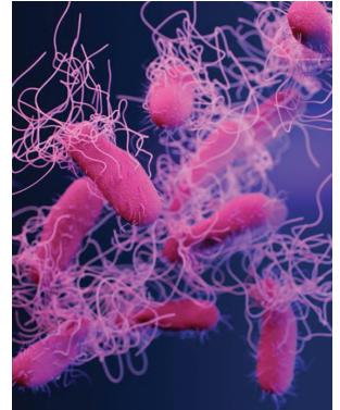
in the United States, 2019 (AR Threats Report); Centers for Disease Control and CDC, 2019.

2008-2010 (no. 48) to the White-Kauffmann-Le Minor scheme. Res Microbiol. 2014;165:526-30. https://doi. org/10.1016/j.resmic.2014.07.004