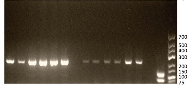
Figure 2. Gel electrophoresis (2% agarose) of products of Trichinella multiplex PCR using samples from patients in Cambodia. Lanes 1–6, patients 1–6: samples were extracted from muscle tissue and show the 240-bp band typical for Trichinella papuae nematodes. Lane 7, patient 7: sample was extracted from muscle tissue and showed no band. Lanes 8–13, patients 8–13: samples were extracted from larvae and show the 240-bp band typical for T. papuae nematodes. Lane 14, negative control; lane 15, positive control ( T. nativa showing the expected 127-bp band); lane M, molecular mass ladder.

1 2 3 4 5 6 7 8 9 10 11 12 13 14 15 M bp