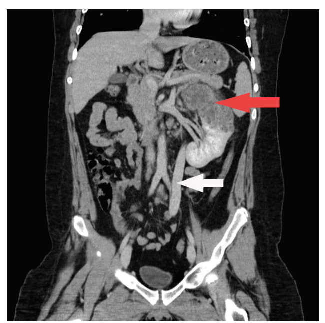
Figure 1. Coronal contrast enhanced CT (computed tomography) of the abdomen of a child with disseminated Echinococcus multilocularis infection without liver involvement, Canada, 2018. There is a large irregular hypodense left renal lesion (red arrow). A large porto-systemic shunt is partially visualized (white arrow).

Under ultrasound, sections of core biopsies showed a predominantly solid lesion composed of dense fibroconnective tissue and containing macrophages, myofibroblasts, occasional multinucleated giant cells, and epithelioid histiocytes (Figure 2). In a