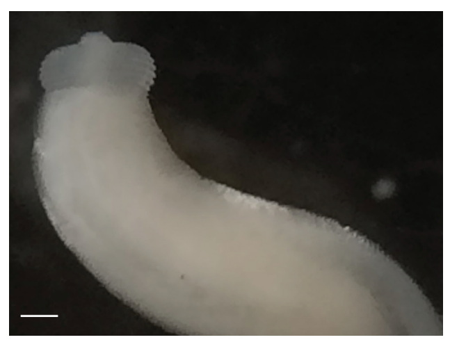
Figure 1. Anterior view of the third-stage larva of Gnathostoma spinigerum isolated from left eye of a woman in Madagascar, 2016. Scale bar indicates 1 mm.

which revealed a worm in the anterior chamber of the left eye. We removed the mobile worm from the left eye through a small sclerocorneal tunnel.