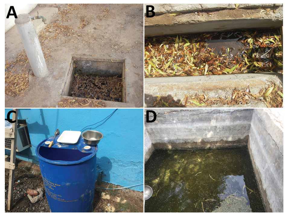
Figure 2. Anopheles stephensi breeding sites, Djibouti, Republic of Djibouti, 2019. A) Manhole. B) Ditch. C) Plastic drum. D) Water tank.

In the Republic of Djibouti, malaria transmission has increased since 2013. Even populations with strong malaria control programs, such as the FAF, are now affected. In 2018, the country notified the World Health Organization of \approx 100,000 suspected cases, mainly among febrile patients with negative results on a rapid diagnostic test (Appendix Figure 1). Considering these suspected cases, we believe the true