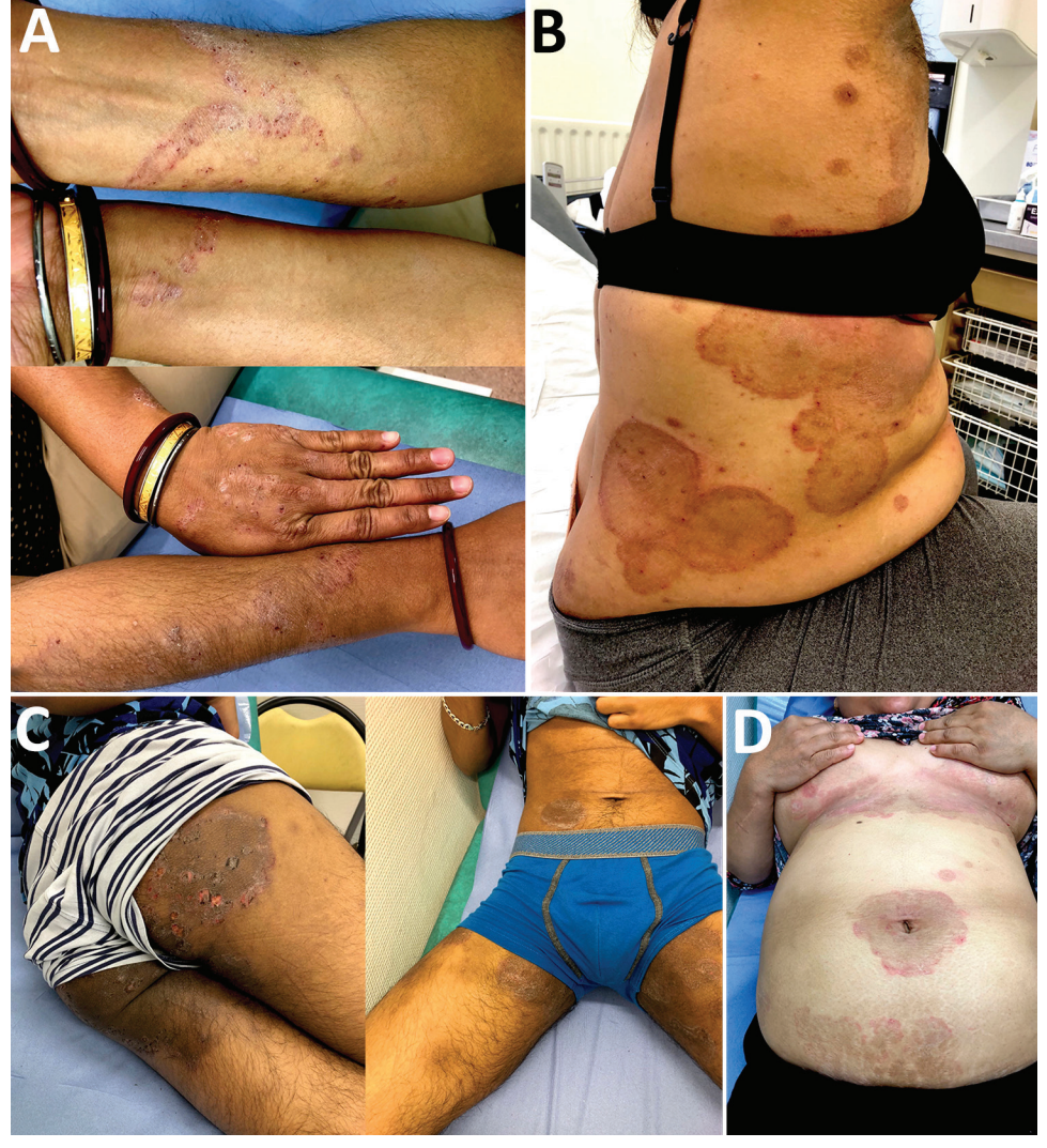
Figure 1. Morphologic features of difficult-to-treat dermatophytosis caused by Trichophyton mentagrophytes complex internal transcribed spacer type VIII (T. indotineae) in patients in Paris, France. A) Scaly plaques with erythema and surrounding papulae and vesicles of the arms (patient 1); B) centrifuge annular erythema of the trunk after topical and oral corticosteroids (patient 6); C) erythematous and scaly plaques (patient 3); D) pruritic cutaneous lesions of the groin and axillary pits to which was applied steroids (patient 5).

Thus far, 10 missense mutations in the SQLE gene have been previously proven in vitro to lead to elevated MICs for terbinafine by genetic manipulation (4,13). The F397L and L393S mutations observed in 5 of our patients have been frequently reported in India and Iran (1,2), as well as in Europe among travelers or migrants (3,4,8,10). A448T substitution was observed in 2 patients, for which both isolates had low terbinafine MICs, and 1 of them had high MICs for azoles, as reported elsewhere (3). With the generalization of sequencing, probability of identifying polymorphisms, such as